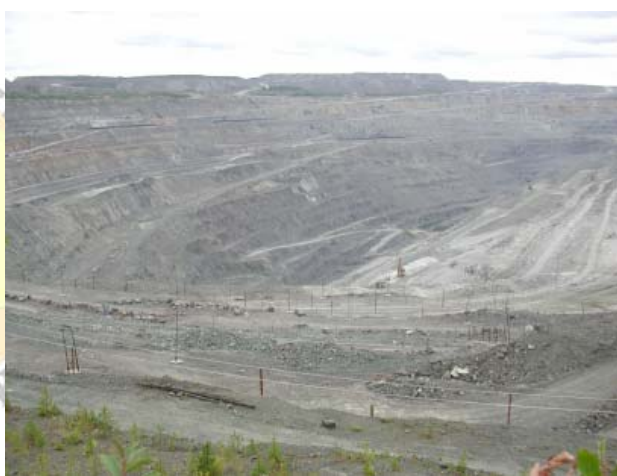
Iron mine. Kostomuksha.