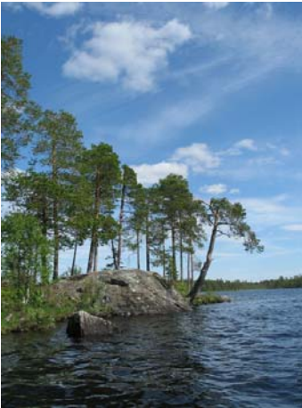
Outcrops of metabasites- high-Mg basalts. Lake Verzhnee (Khizovaara structure)